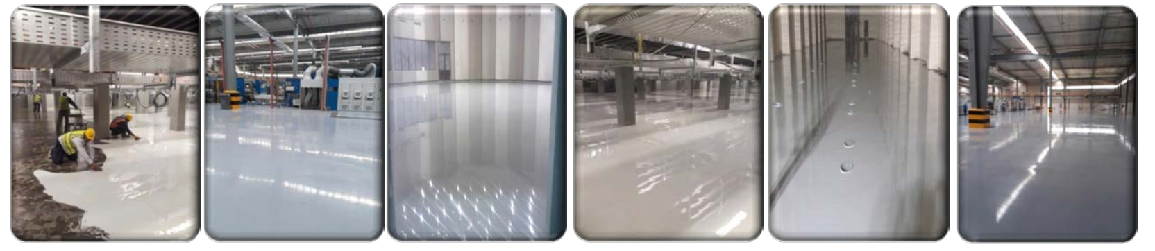
Self Smoothing System